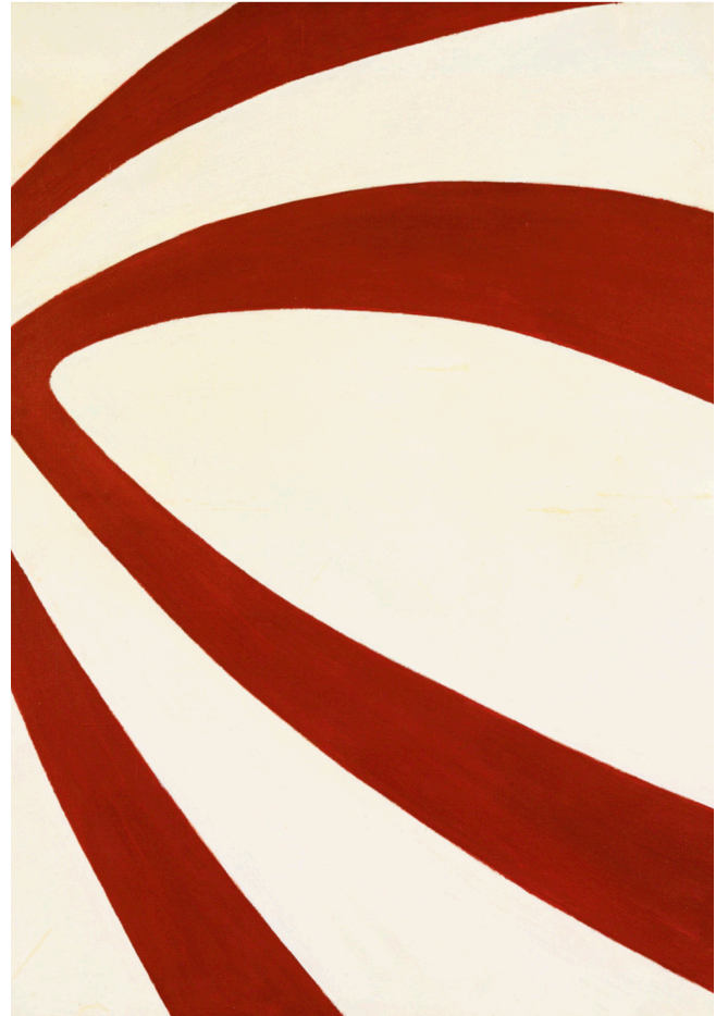
Charles Greene Curvature Red and White, 1965.

American modernism through the American Abstract Artists group, the selection emphasizes both historical continuity and formal innovation. Contemporary perspectives by Barrandeguy and Berned, alongside the refined sculptural language of Atchugarry, further extend this dialogue, reinforcing the enduring relevance of abstraction as a global and evolving visual language.